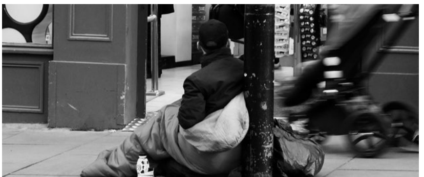
Poverty and social security: where next?

The project is a partnership with Age UK, the Children's Society, Crisis, the Joseph Rowntree Foundation and the TUC.